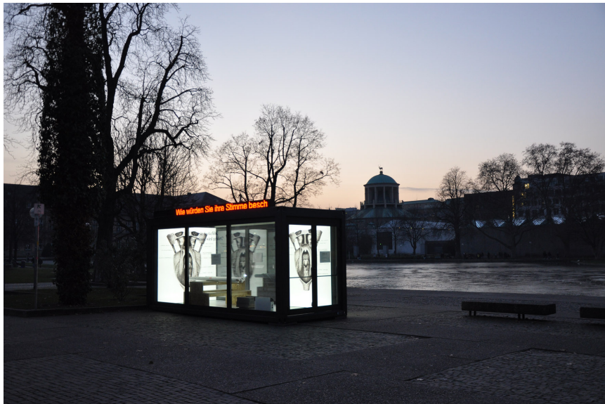
Orpheus Box – installation in front of the opera house, a research room: for listening, talking and reading about voice

https://www.staatsoper-stuttgart.de/spielplan/orpheus-institut/